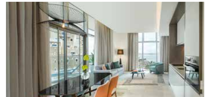
Panoramic Palm Sea View 3 Bedroom Suite