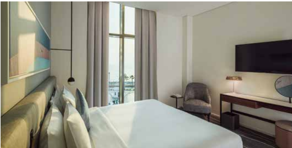
Standard Room Ocean View