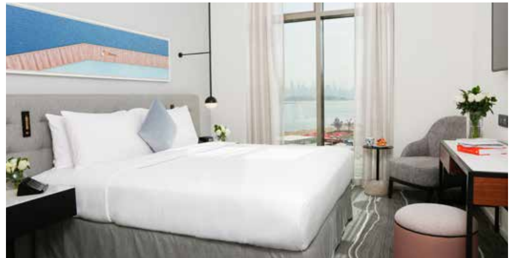
Standard Room Palm View