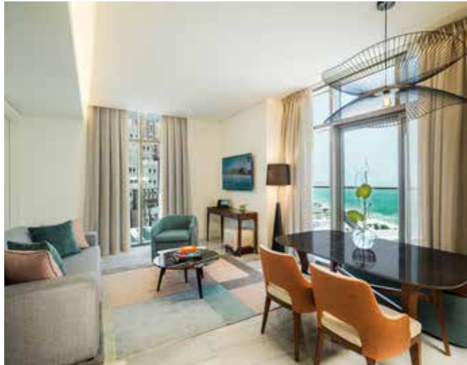
Palm Sea View One Bedroom Suite