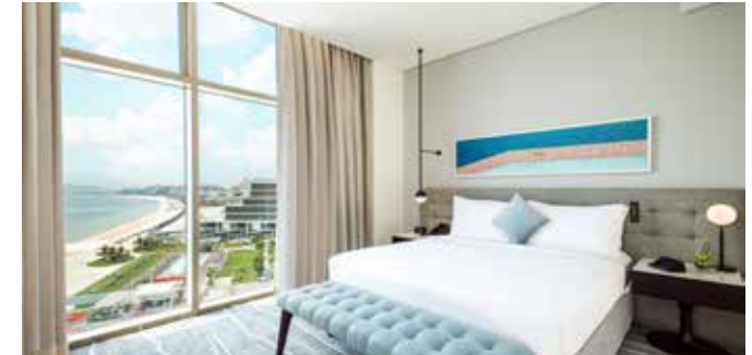
Panoramic Palm Sea View 2 Bedroom Suite