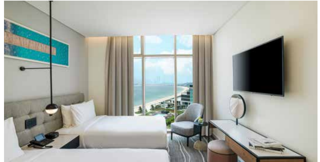
Standard Twin Room