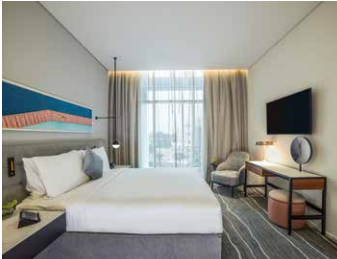
One Bedroom Suite