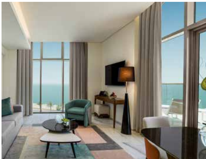
Ocean View One Bedroom Suite