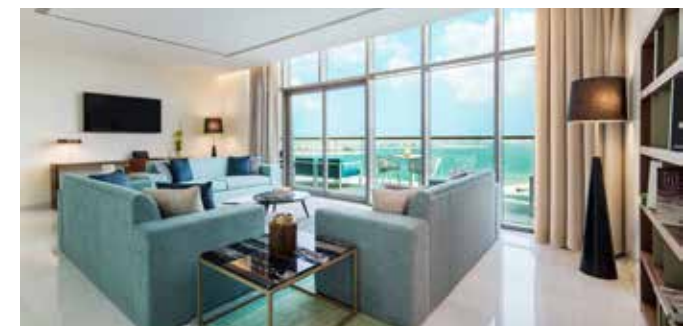
Penthouse Suite with Palm Sea View