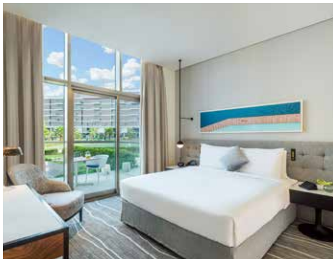
Garden Access One Bedroom Suite