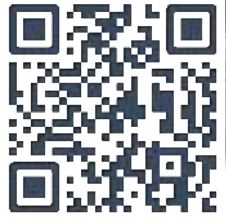
Scanning QR code for A-la Carte restaurant booking Ethno Loca / Trattoria Italian / Wazuzu Asian