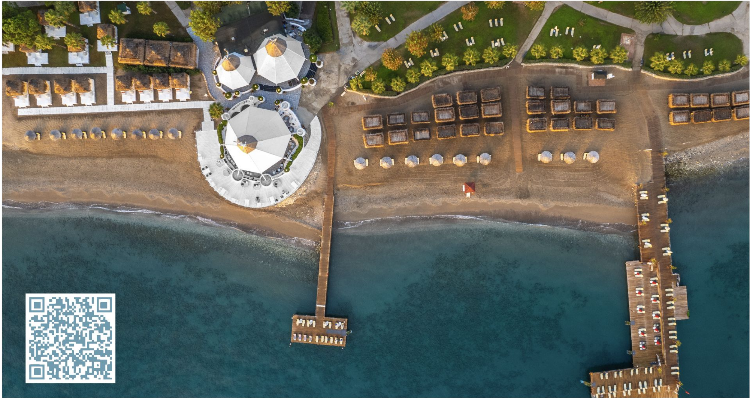
PALOMA Foresta, Beldibi | Summer 2024 Fact Sheet